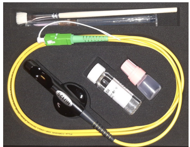
The above photo shows an SM unit with SC/APC connector

SPECIFICATIONS: Fiber Diameter: 125 +/-2 \mu\text{m} Insertion Loss: typically < 0.3dB Alignment Time: approx. 1 sec Number of Insertions: > 10,000 Reflection Loss: typically > 50dB Operating Temperature Range: -10°C to 50°C. Bare Fiber Ends do not need special cutting tools - the fiber can be broken by hand or cut with scissors, although specialist fiber cutters give lowest insertion losses (refer to picture for examples). HU-125-SM with FC/UPC or SC/APC with approx. 1.4 meters of cable are the standard singlemode units (9/125 \mu\text{m} fiber). Singlemode connector options include FC and SC, with either UPC or APC. HU-125-MM (multimode unit) is available with 62.5/125 \mu\text{m} or 50/125 \mu\text{m} graded index (GI) fiber and has approx. 1.4 metres of cable. Multimode connector options include FC/PC and ST/PC. A cable length of approx. 3 meters is optionally available for all singlemode and multimode units. An HU/125/80 option incorporates a cable with 80 \mu\text{m} diameter fiber for measurements on 80 \mu\text{m} bare fibers. The HU-125 comes with index matching oil, cleaning brush, needle, cleaning wires, and manual.